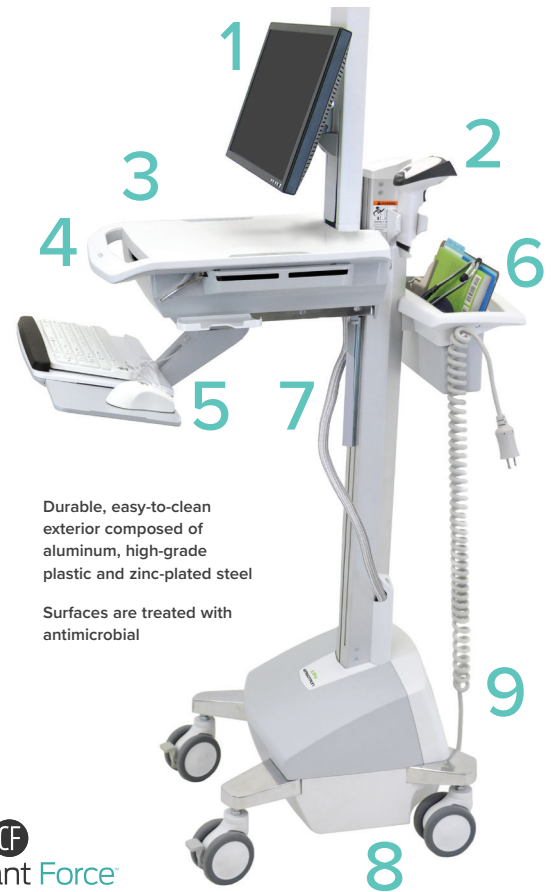
SV42 LCD Pivot cart

Durable, easy-to-clean exterior composed of aluminum, high-grade plastic and zinc-plated steel