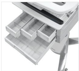
SEVERAL DRAWER CONFIGURATIONS