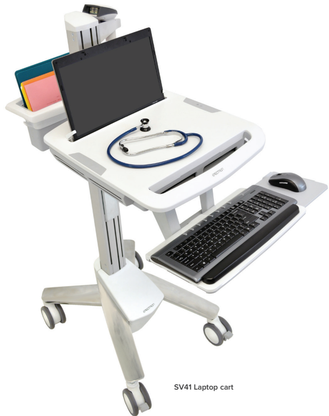
SV41 Laptop cart