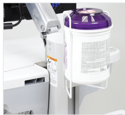
SV SANI-WIPES HOLDER