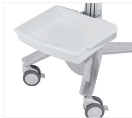
SV FRONT TRAY