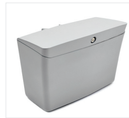
SV STORAGE BIN