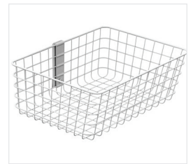
SV WIRE BASKET, LARGE